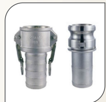
per EN ISO 228-1 cam & groove hose shank