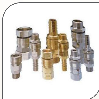
Per ISO 7241, 16028