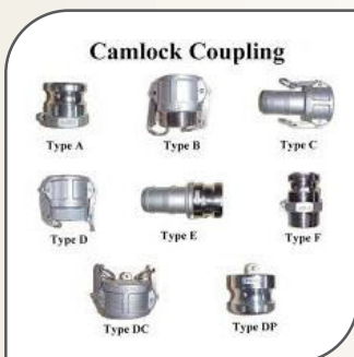
As per MIL-C-27487, EN 14420, DIN 2828