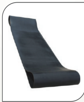
Endless Shot Blasting hot vulcanized per IS 1891