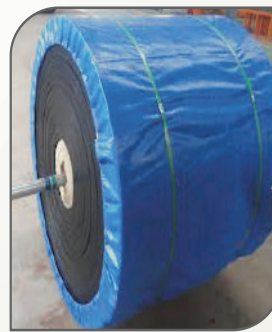
Conveyor Belt Packed Roll