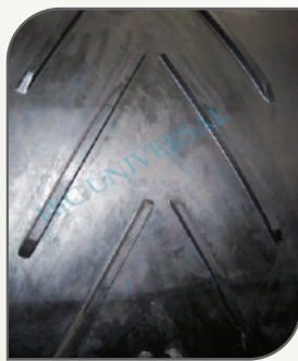
Chevron V Cleat C15 Pattern per DIN 22102