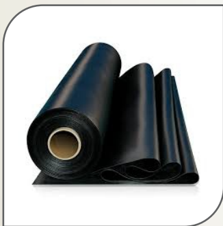
Synthetic SBR, EPDM, Neoprene, Silicone, Viton As per IS 5192, BS 2752