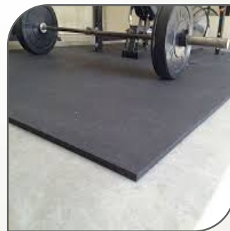
Gym Rubber Mat