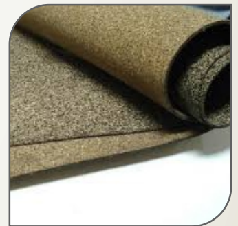
Nitrile Rubberized Cork per IS 4253